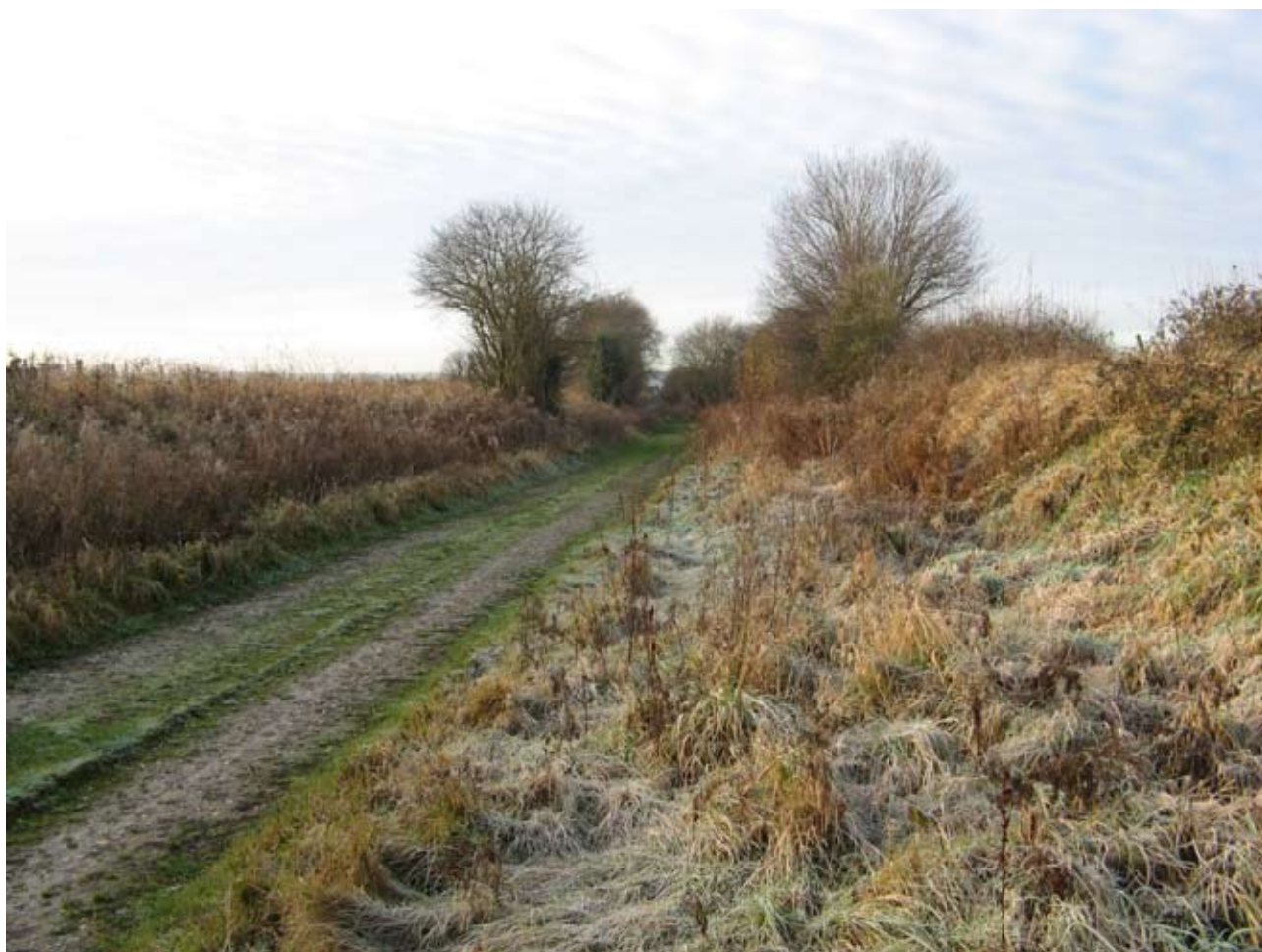
Section of the disused Lewes-Uckfield track 10 December 2007

The Central Rail Corridor Board comprises local MPs and representatives from regional, county and district levels, to provide a planning and policy perspective for reinstatement of the Central Rail Corridor, and much work has taken place to get to the stage we are at today.